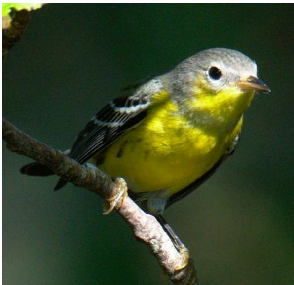
Magnolia Warbler