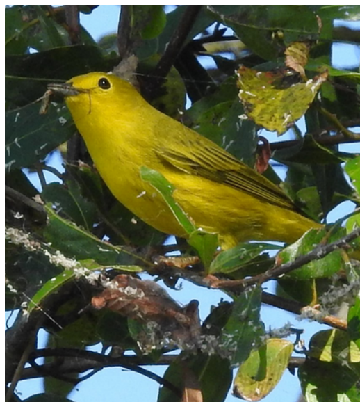
Yellow Warbler