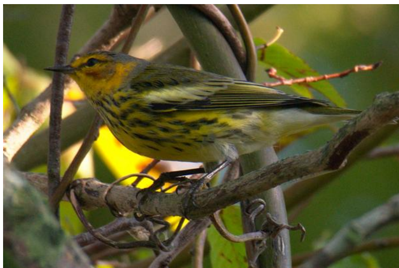
Cape May Warbler, above Black-and-white Warbler, left